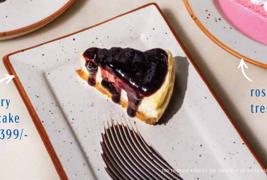
blue berry cheese cake 399/-