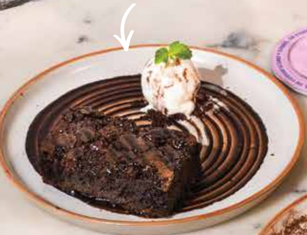
double chocolate brownie 399/-