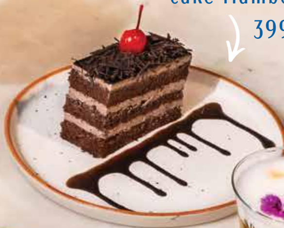
chocolate cake flambe 399/-