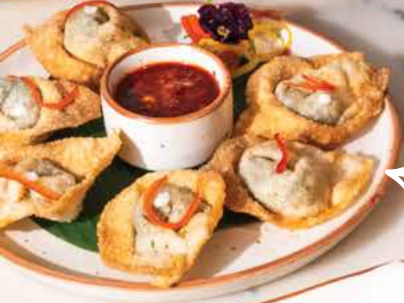
spinach feta wonton